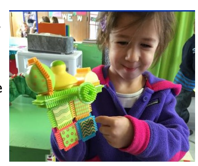
table to help learn concepts such as measuring and spatial reasoning. garteners have some structured time in kin-

Students have the opportunity to explore and learn at various centers throughout the day, such as reading, writing, math, science, art, construction, puzzles, and dramatic play. We also use a sensory